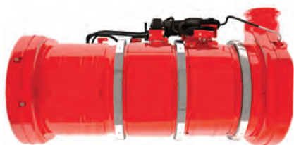
Single Module Aftertreatment System